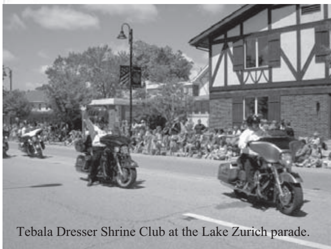
Tebala Dresser Shrine Club at the Lake Zurich parade.

2010 Tebala Potentate's Motorcycle Run & Tebala Director's Staff Road Rally Sunday, September 19, 2010 Tebala Shrine Center Coffee and Rolls will be served from 9:00—10:00am 10:00am Departure The run will end at Tebala Shrine Center where Burgers and Brats will be served by Tebala's Director's Staff for a donation per person.