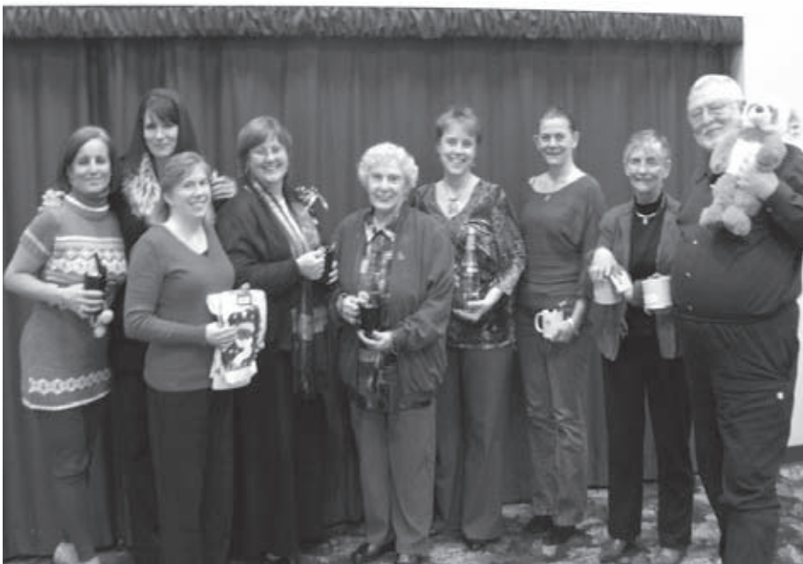
2011 Valentine's Day Bingo prize winners pose with their prizes at Tebala on Friday, February 11th.

The weather outside may have been cold and snowy but the activities inside the temple were warm and fun filled. A large group gathered in the temple to enjoy a wonderful meal of roast loin of pork, potatoes and green beans. All of this was topped off with the award winning Hoffman House cake for dessert.