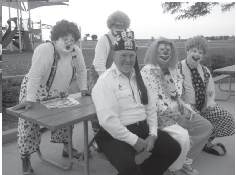
Kids are Key